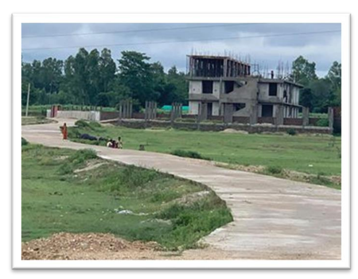
Eye Hospital under construction