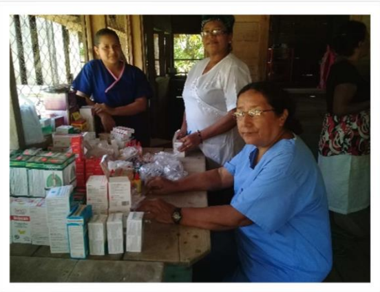
Nurses at the clinic distribute medications